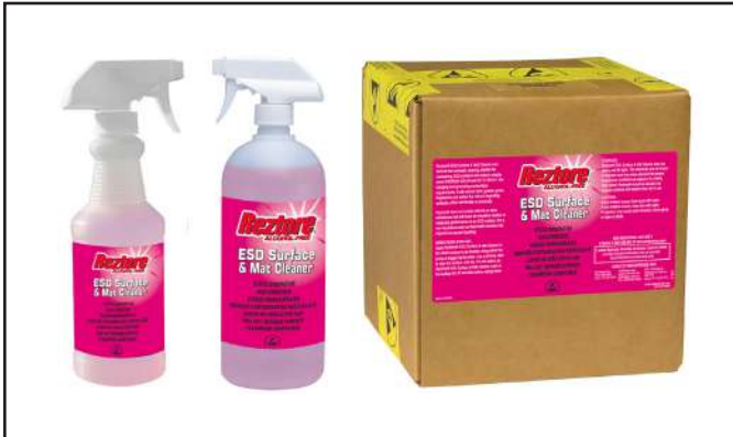
Figure 1. Reztore® Alcohol-Free ESD Surface & Mat Cleaner: 16 Ounces (450 ml) Spray Bottle 1 Quart (950 ml) Spray Bottle 2.5 Gallons (10 liters) Bag-in-Box